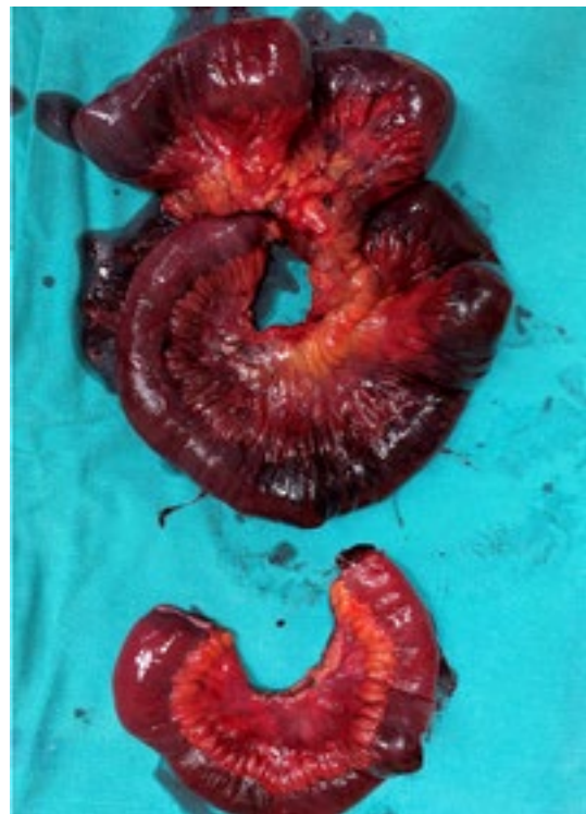
Figure 1. Small bowel resection material. There are areas of ischemia and necrosis in two different parts of the small intestine.

findings exacerbated and her general condition started to deteriorate. We obtained informed consent from the patient. Surgical exploration encountered slightly serohemorrhagic fluid of 200 cc, as well as circulatory impairment and necrosis intermittently located at the two separate sections of the small intestine, beginning from the 90th cm after the Treitz ligament in the abdomen (Figure 1). A necrotic small bowel resection of approximately 150 cm was performed at two separate sections. The other findings observed during the surgery were as follows: 1) thrombi in the moderate and small-sized veins of the small bowel mesentery despite the presence of pulses in the arteries feeding the small intestines, 2) thickening of small bowel mesentery, 3) small and moderate-sized venous vein dilatation observed in the right halves of the right colon and transverse colon, and 4) left ovarian cystic lesion. Towards the end of the surgery, regeneration of ischemic fields was encountered in the small bowel segments close to the anastomosis. A second-look laparotomy was decided upon to control the presence of new ischemia in the small intestines.