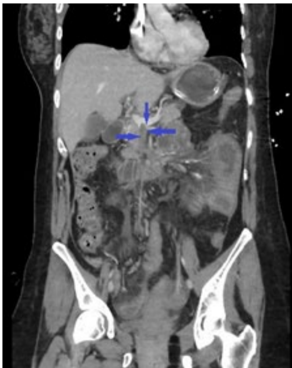
Figure 2. Coronal CT section shows a long segment thrombus (Arrows) creating a filling defect in SMV.

The administration of intravenous total parenteral nutrition (40 cc/h), intravenous antibiotics and full anticoagulation with low molecular weight Heparin (2*6000 anti-Xa IU) was postoperatively initiated and continued until discharge from the hospital. The embryo was removed after confirmation of stillbirth by the postoperative gynecological examination. The contrast-enhanced computed tomography (CT) performed on the 1st postoperative day revealed a long segment thrombus in the superior mesenteric vein (SMV) and pulmonary embolism (Figure 2). A second-look laparotomy was carried out 48 hours after the first surgery. The exploration showed that blood supply and feeding of all the intestinal anses were intact, while no anastomotic complication was present. The histopathological examination of the section resected in the first surgery demonstrated sporadic necrotic fields in the small bowel wall (Figure 3).