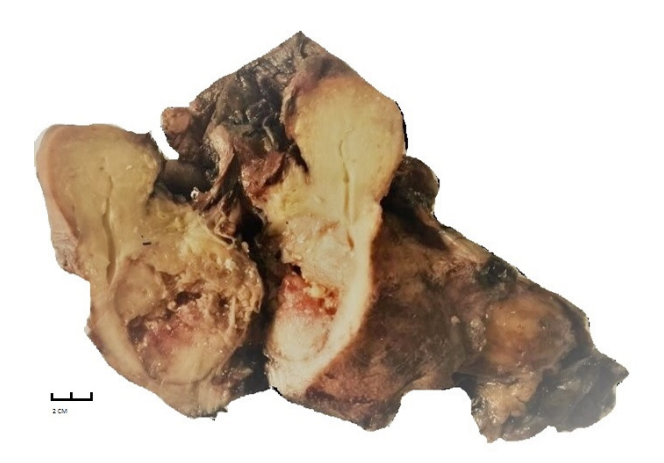
Figure 2. Gross appearance of cervical carcinosarcoma. Tumour localised to the posterolateral region of the cervix, with parametrial extension and large necrotic areas and areas of mixoid appearance

Anatomic pathology revealed a 8 x 7 x 4.5 cm mass located in the cervix associated with great deformity of the posterior wall, with parametrial and marginal involvement (Figure 2). Histologically, it was consistent with a biphasic malignant tumour composed of a small-cell epithelial component with areas of glandular and squamous differentiation and some areas of basaloid appearance and others with corneal bead formations; and an undifferentiated mesenchymal component consisting of fusiform cells with inconspicuous cytoplasm in a mixoidlooking matrix. Immunohistochemistry showed immunoreactivity for AE1-AE3 and cytokeratin 7 in the epithelial component, and no reactivity for synaptophysin or chromogranin, with neuroendocrine differentiation exclusion. Cell proliferation index determination with Ki67 was close to 100% in the epithelial component and close to 80% in the